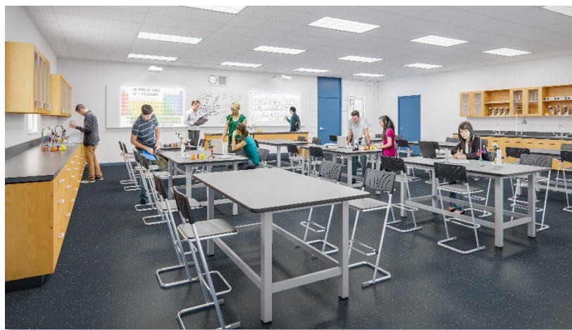
University HS: Modernization