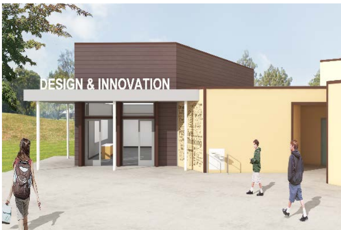
Stone Creek ES: Design & Innovation Lab