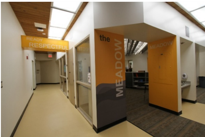
Santiago Hills ES: Enclose Classrooms