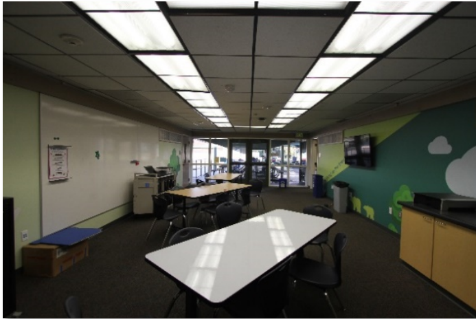
Bonita Canyon ES: Enclose Classrooms