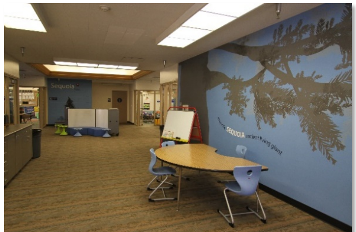
Greentree ES: Enclose Classrooms