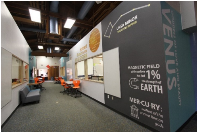
Culverdale ES: Enclose Classrooms