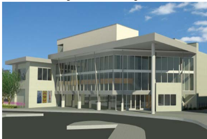
Woodbridge HS: Performing Arts Theater