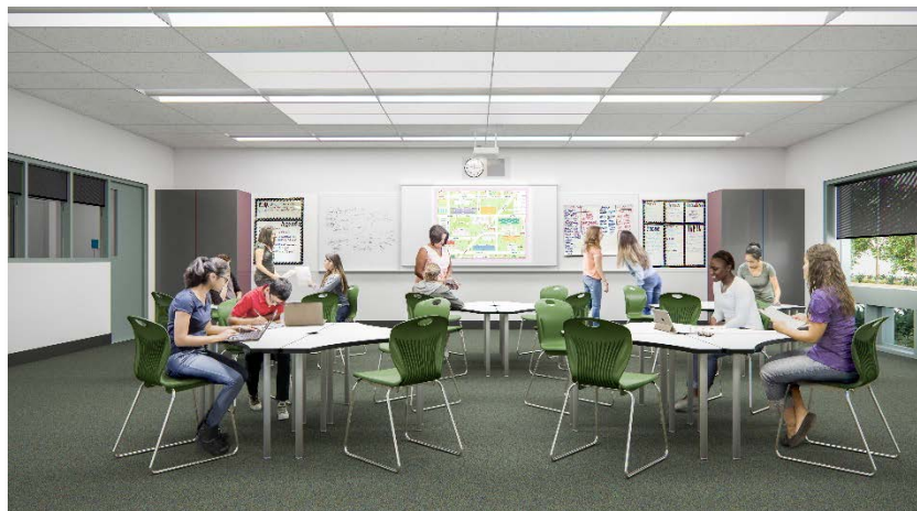
Irvine HS: Modernization