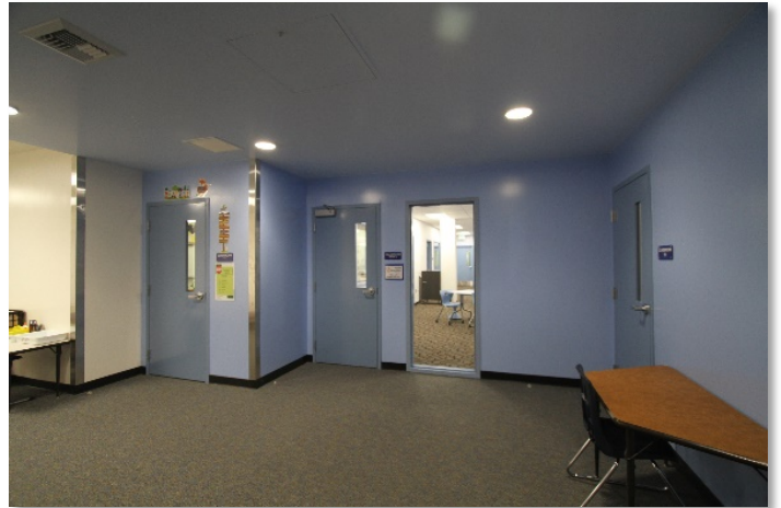
College Park ES: Enclose Classrooms (Phase 1)