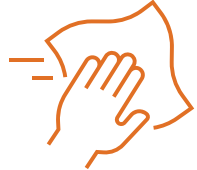
Thorough Cleaning and Disinfection

With guidance from the Orange County Health Care Agency, schools may typically reopen after 14 days with the following measures: