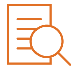
Public Health Investigation