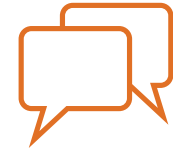
Consultation with the Orange County Health Care Agency