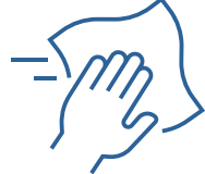
Cleaning and Disinfecting