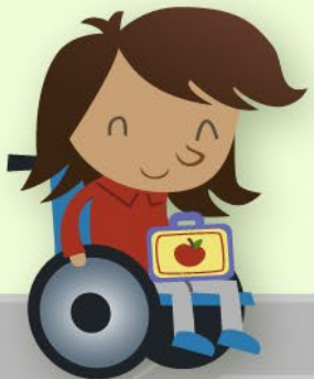
Table 5 does not include the specialized teaching support that these students receive. Irvine has on staff Educational Specialists who support the Deaf & Hard of Hearing population, Teacher of the Visually Impaired, Audiologist, and Orientation & Mobility Specialist.

These students often require specialized equipment or other aids & services to support their success in the Regular Classroom