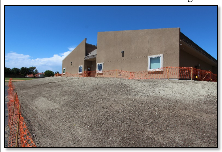
Sierra Vista MS: New Science Building