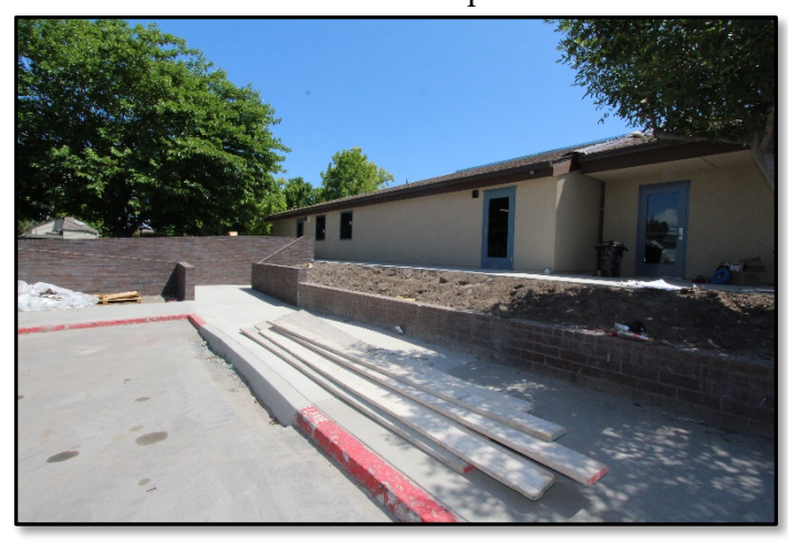
Eastshore ES: Expansion