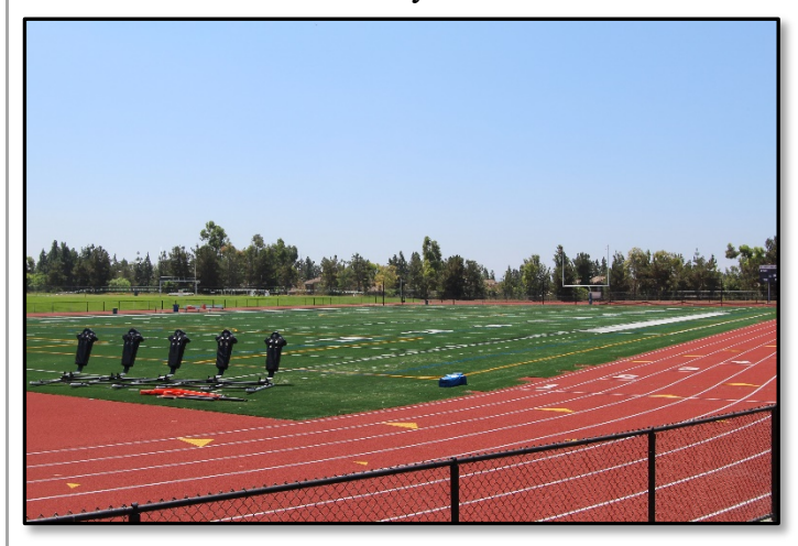
El Camino School: Meadow Park ES Interim Campus