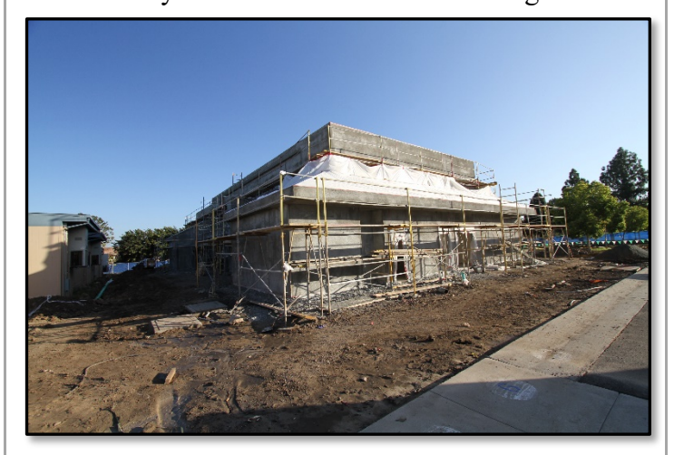
Brywood ES: New Music Building