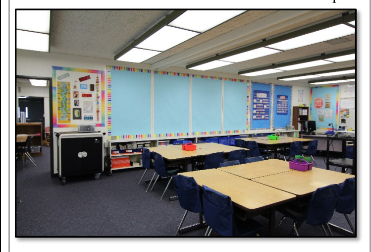
El Camino School: Meadow Park ES Interim Campus