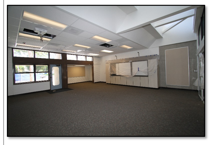
Meadow Park ES: Modernization