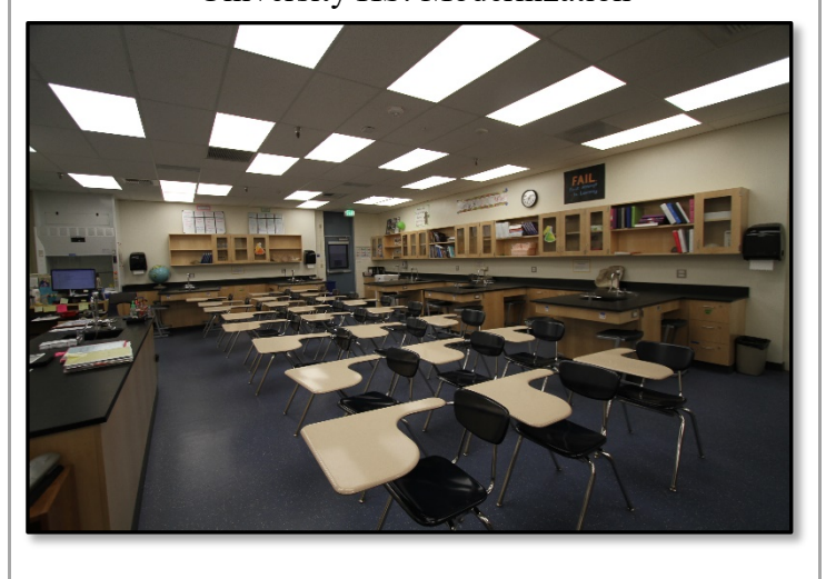
University HS: Modernization