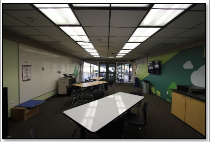
Greentree ES: Enclosed Classrooms