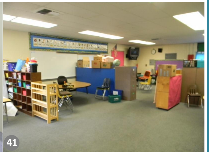
41 Typical portable (P19)