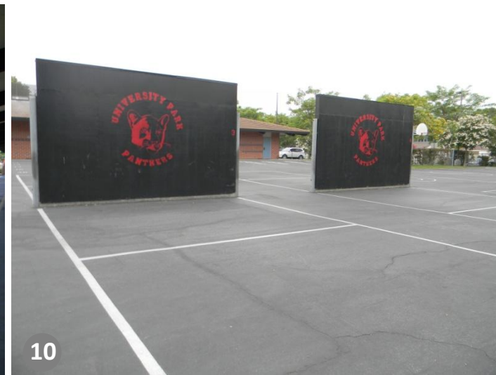
10 Hard courts