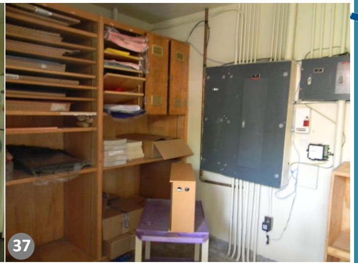
37 Custodial area