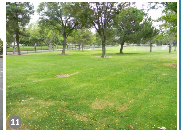
11 Playfield near hard courts