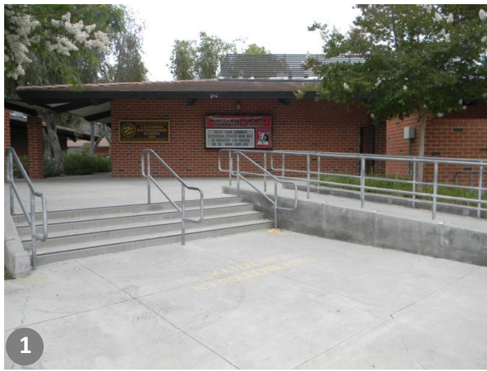
1 Front of school