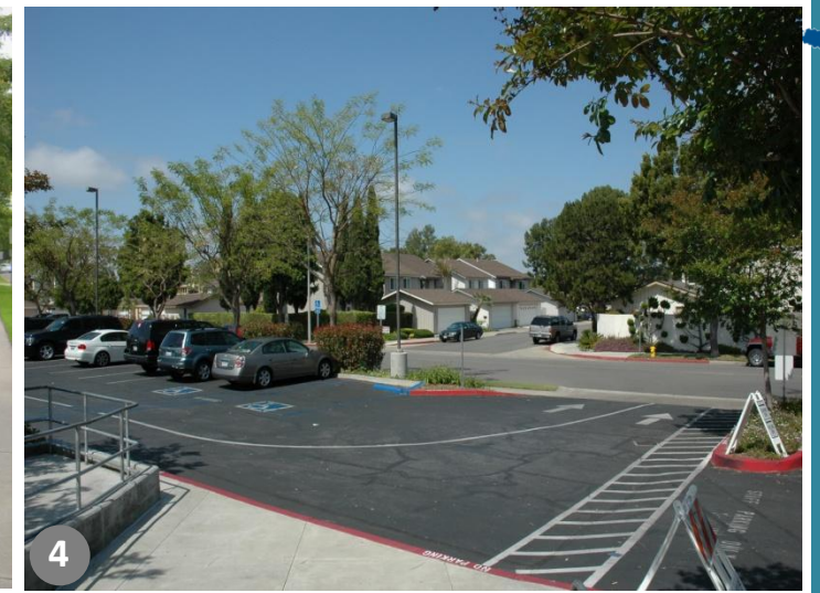
4 Parking lot