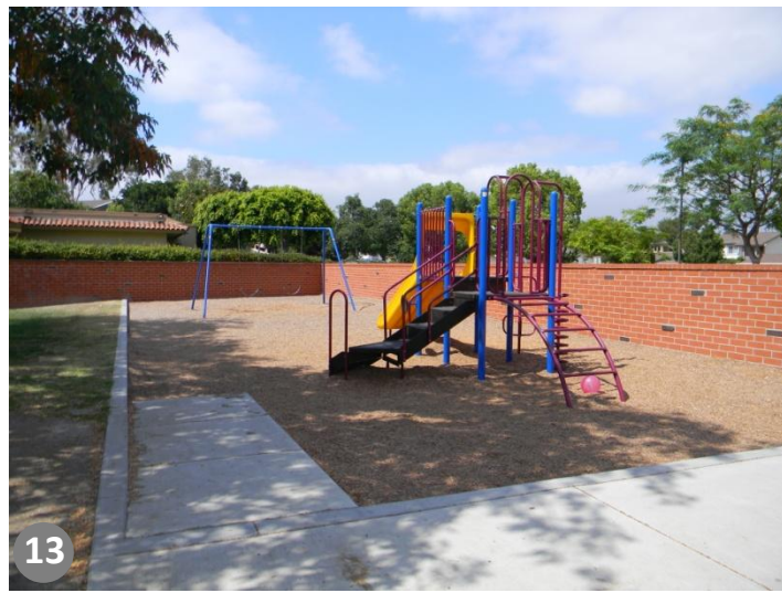
Kindergarten play apparatus