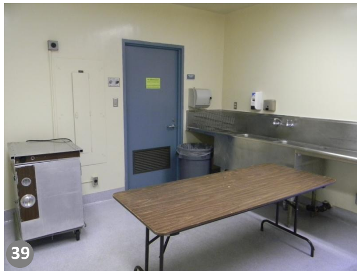
39 Food Service