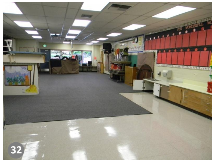
Typical Kindergarten classroom