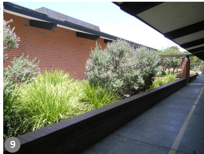
9 Walkways between classrooms