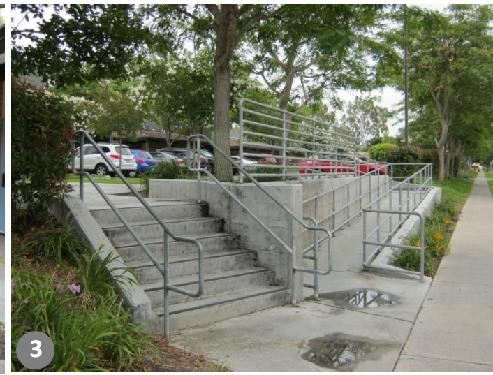
3 Secondary entry