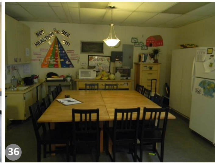
36 Typical childcare portable