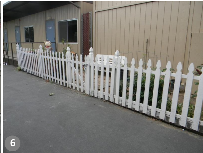
6 Instructional garden near childcare portables