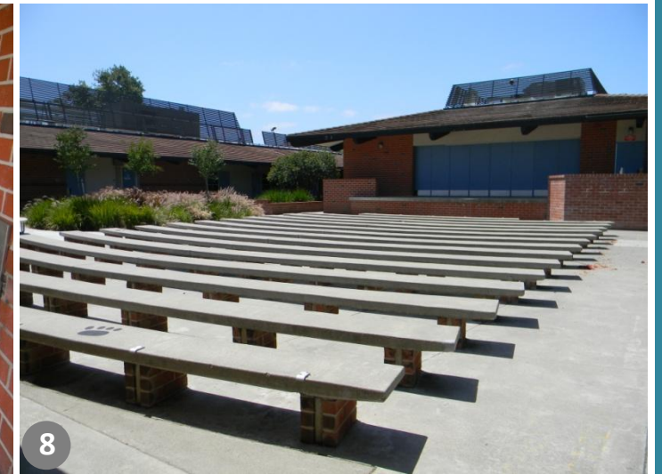
8 Outdoor amphitheater, behind MPR