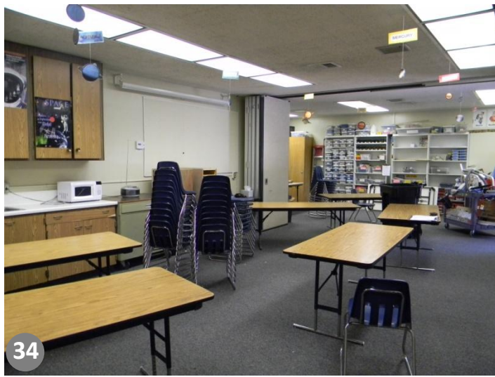
34 Science classroom