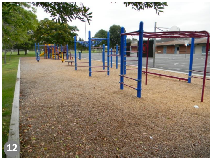
Play apparatus near hard courts