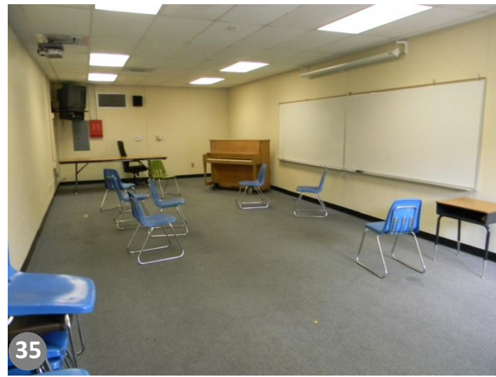
35 Music classroom (portable)