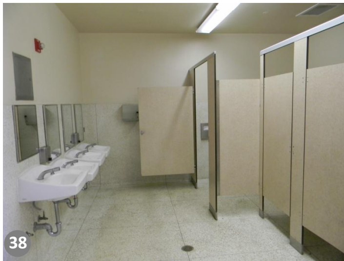
38 Typical bathroom