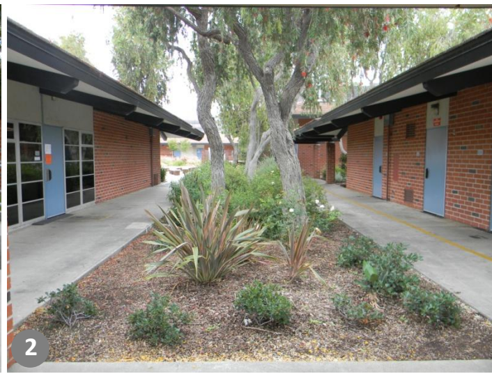
2 Courtyard near main entrance