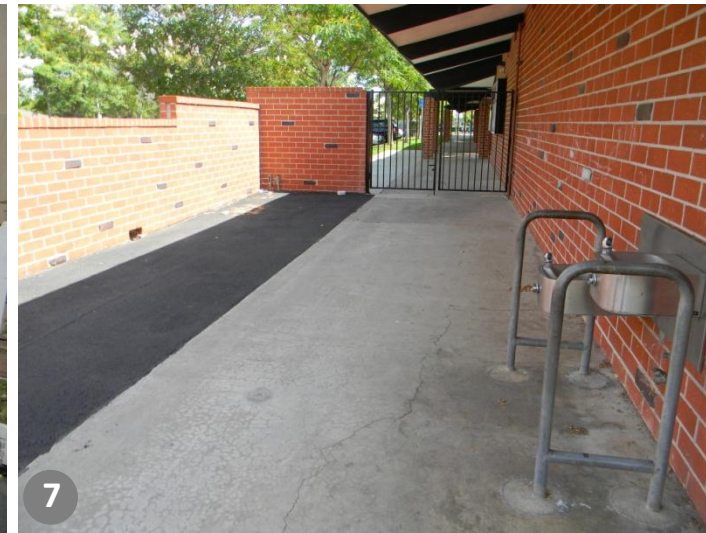
7 Entrance near Kindergarten play structure