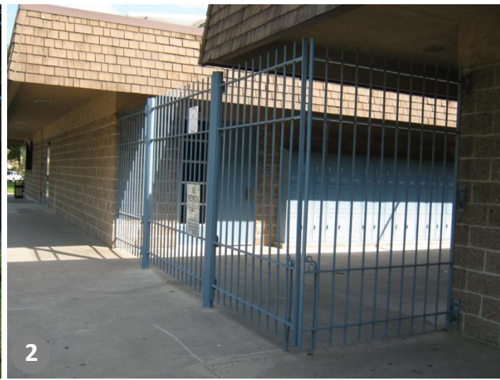
2 Front Entrance to Quad