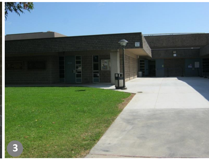
3 Entry to Administration and MPR