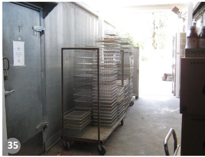
Central Kitchen Exterior Freezers