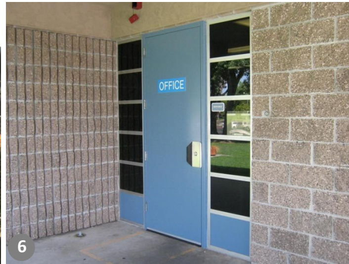
6 Main Office Entrance