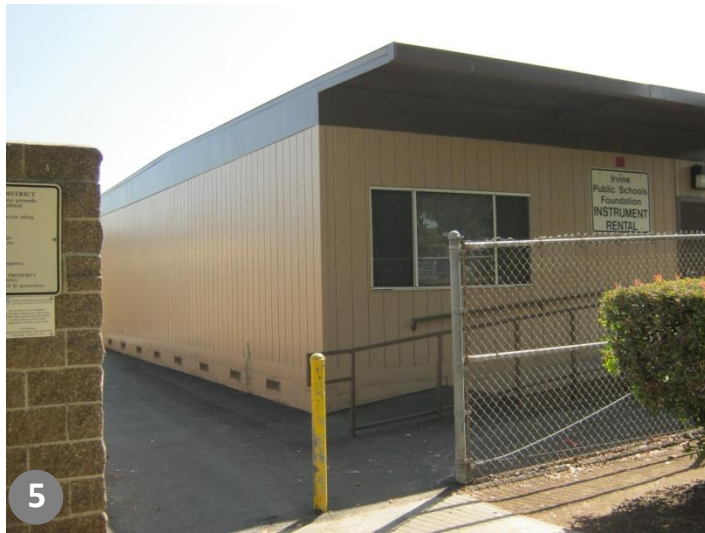
5 Entry to Portables and Hardcourts