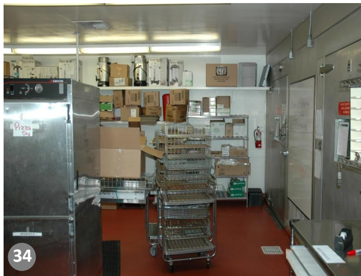
Central Kitchen Interior Freezers