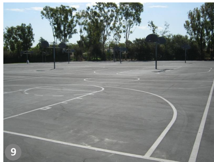
9 Basketball Courts