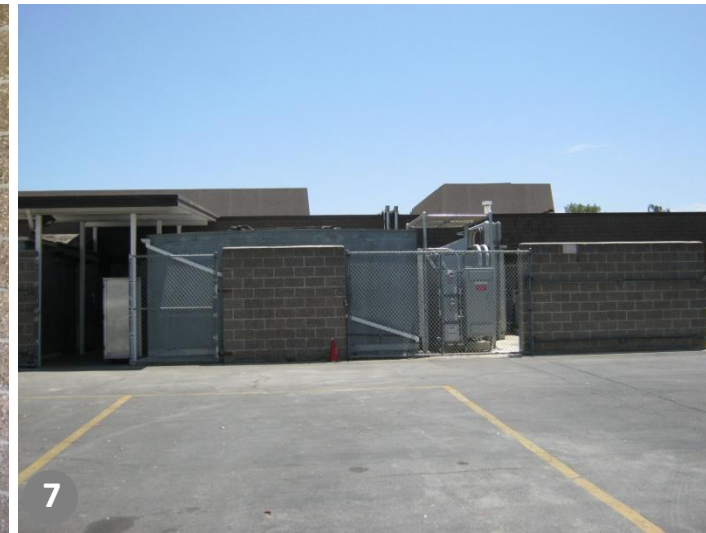
7 View of Outer Components of Central Kitchen