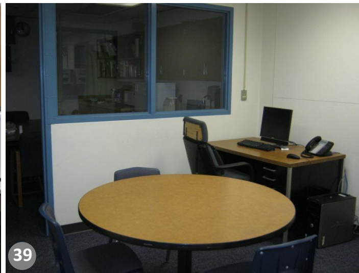
Pod Conference Room