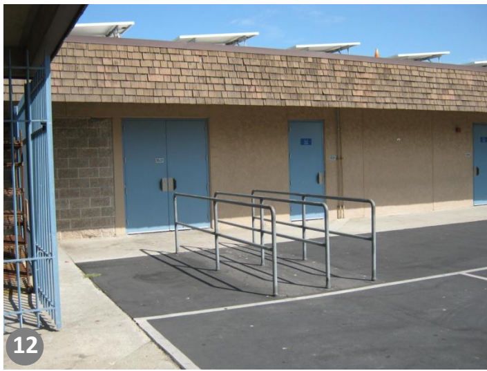
Food Service Queue