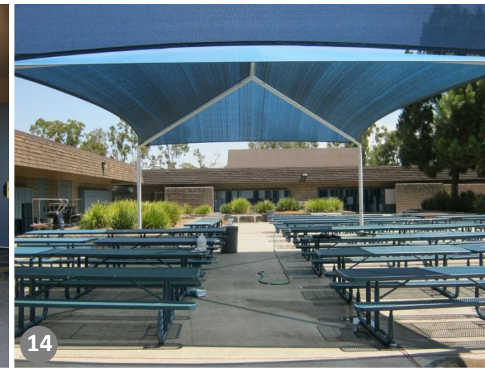
Sheltered Lunch Area