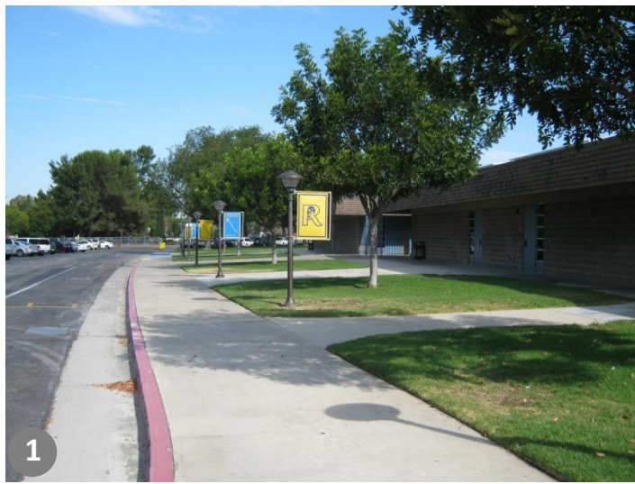
1 Front of School