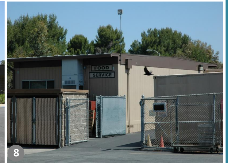
8 Nutrition Portable and Storage