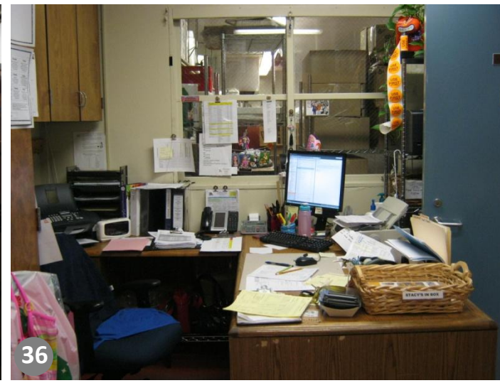
Central Kitchen Office