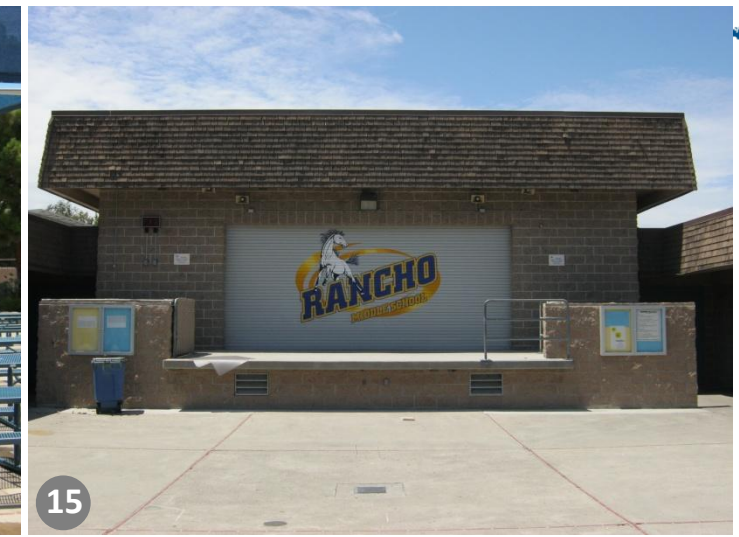
Outdoor Stage in Courtyard