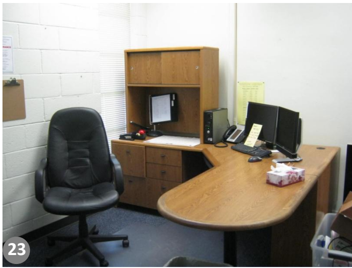
Assistant Principal's Office