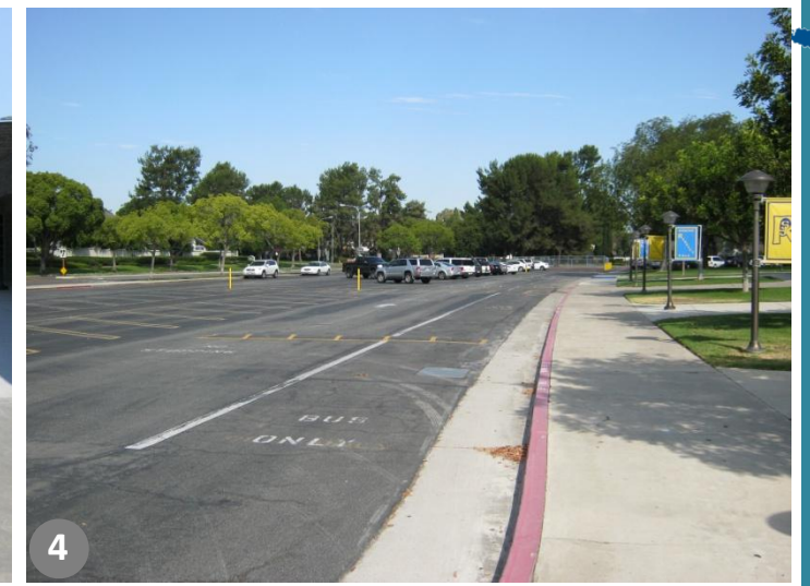
4 Parking and Drop-Off