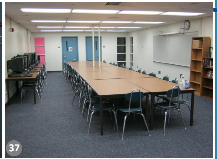
Central Collaboration Space