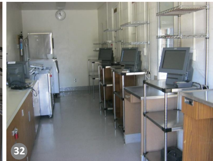
Additional Food Serving Area