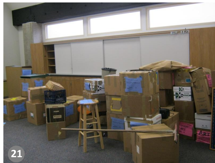
Music/Science Classroom (MPR "Stage" Area)