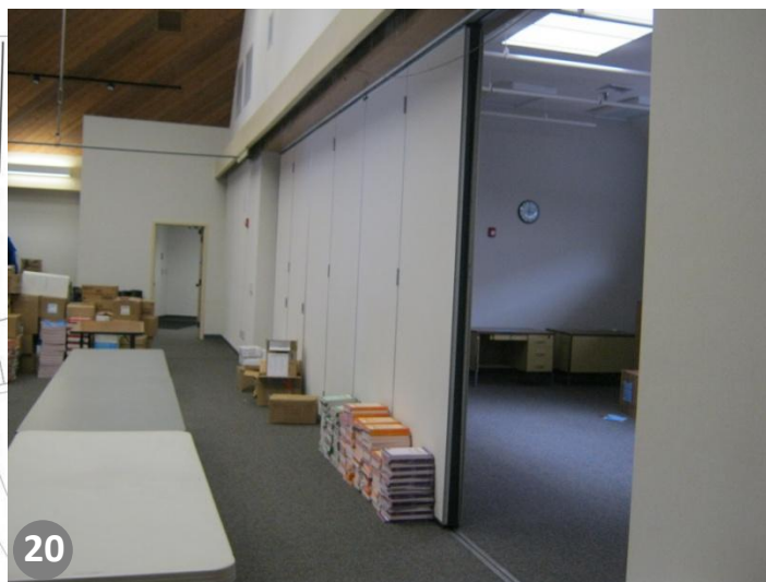
MPR Stage Area with Moveable Partition