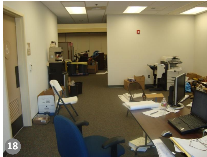
Reception Area near MPR in Main Building