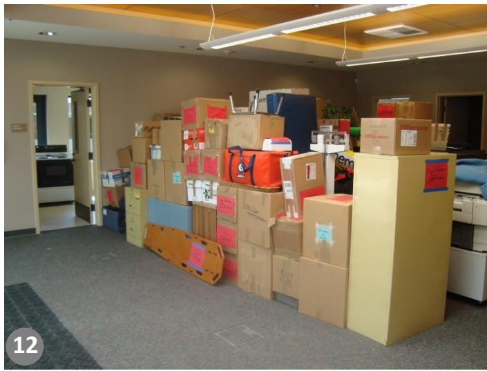
Administrative Building, Main Office