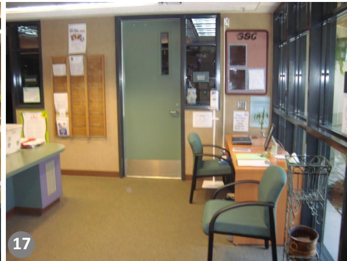
Waiting Area and Computer Kiosk