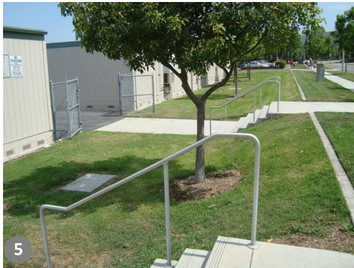
5 Access to portables from Yale Court