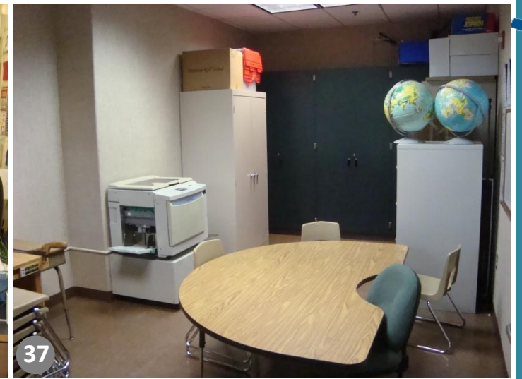
Typical Satellite Workroom near Student Collaborative Area