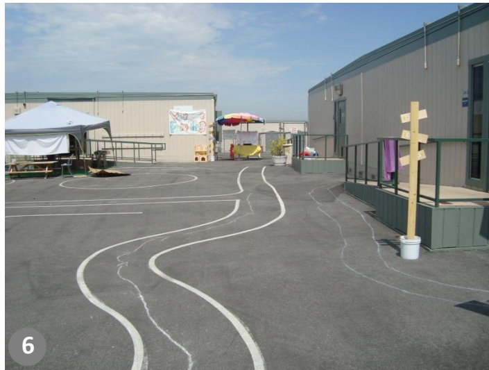
6 Childcare Portables