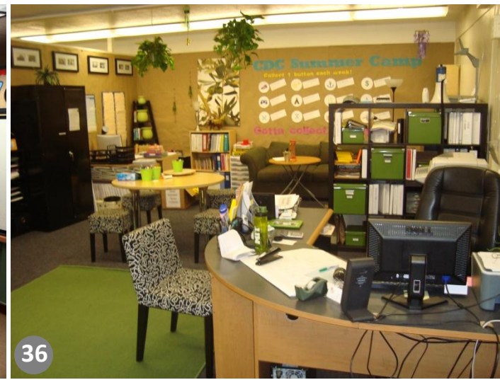
Typical Childcare Portable