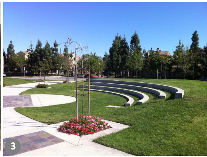
3 Outdoor Amphitheatre