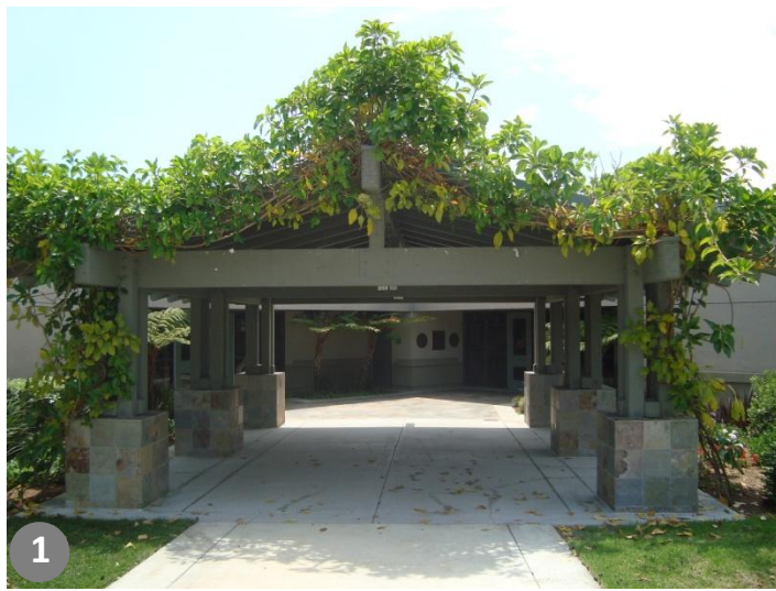
1 Front Entry of School