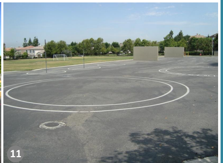
11 Handball Courts and Playfields