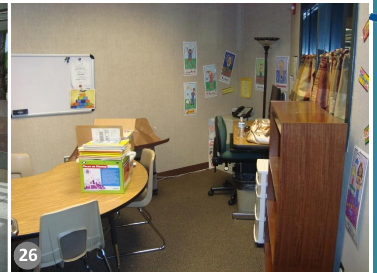
Speech Room near Library/Media Center