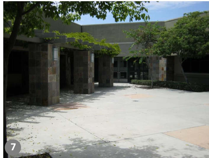
7 Central Courtyard adjacent to MPR