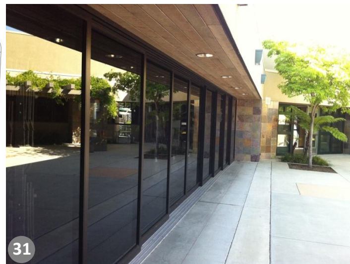
Indoor/Outdoor Connection in MPR