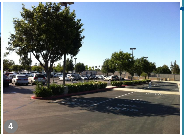
4 Parking and Drop-off