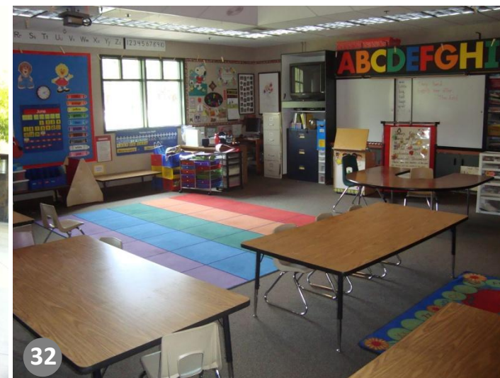
Typical Kindergarten Classroom