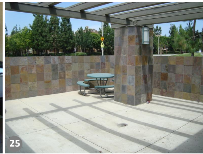
Staff Patio outside Lounge