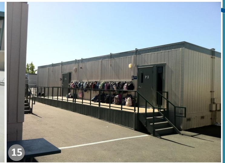
Portables (P3 and P4)