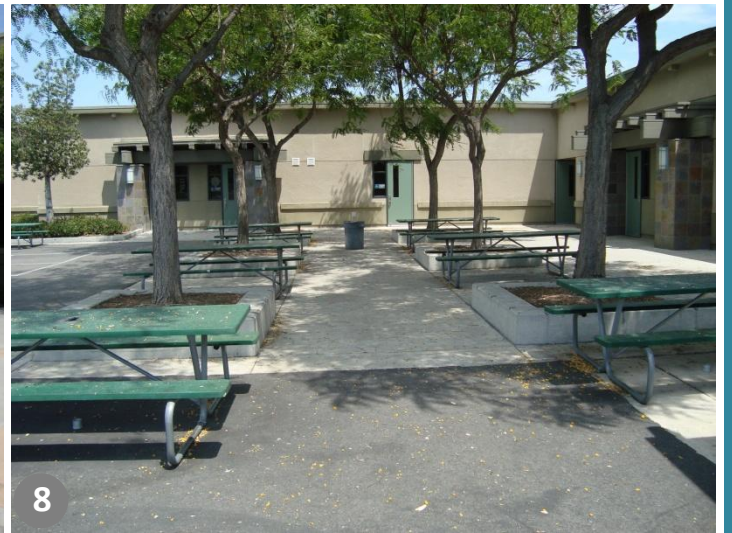
8 Courtyard adjacent to Classrooms