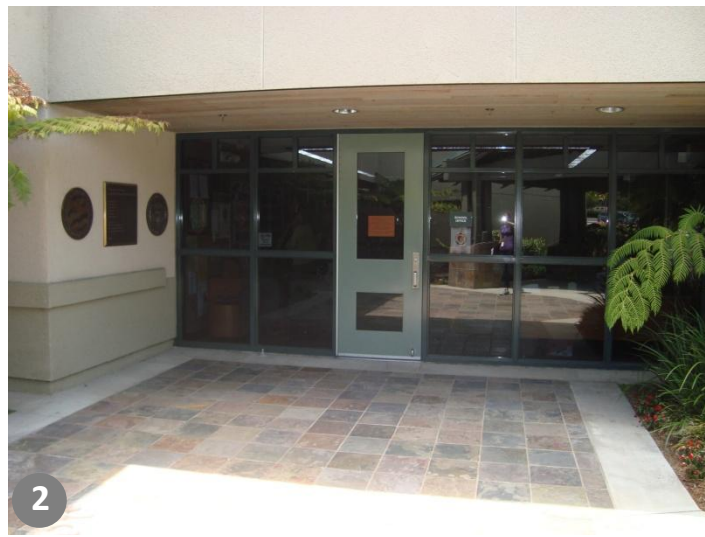
2 Main Entrance