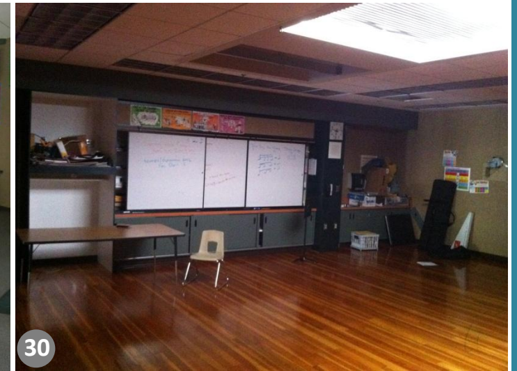
MPR Stage Classroom