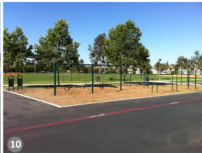
10 Play Yard showing apparatus and fields