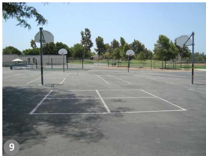
9 Basketball Courts and Playfields