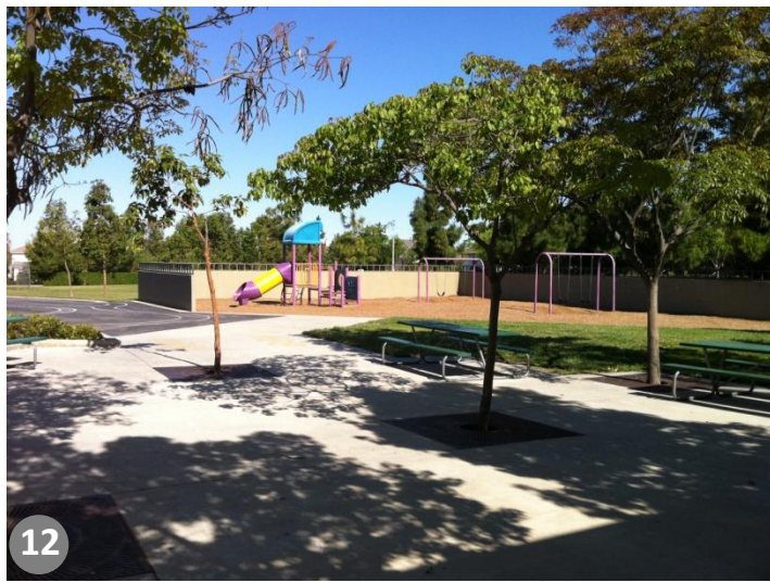
Kindergarten Play Apparatus