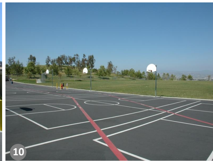
10 Basketball courts and playfields