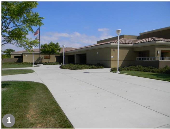
1 Front of school