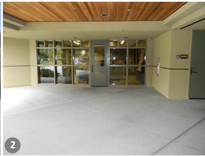
2 Main entrance