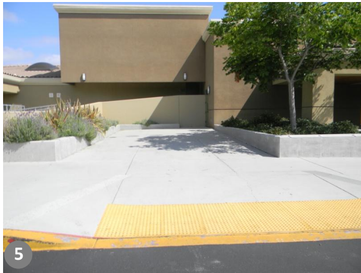
5 Curb cut near drop-off and MPR building