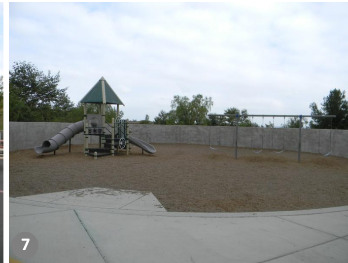
7 Kindergarten play apparatus