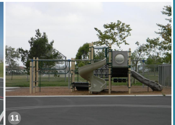
11 Play apparatus