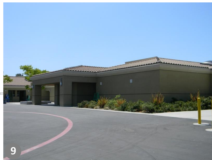
9 Back of campus near classroom courtyards