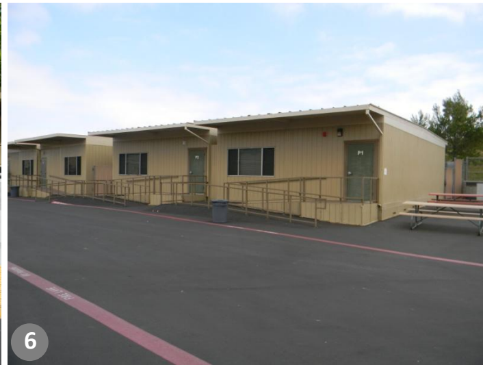
6 Portables 1, 2, 3, 4