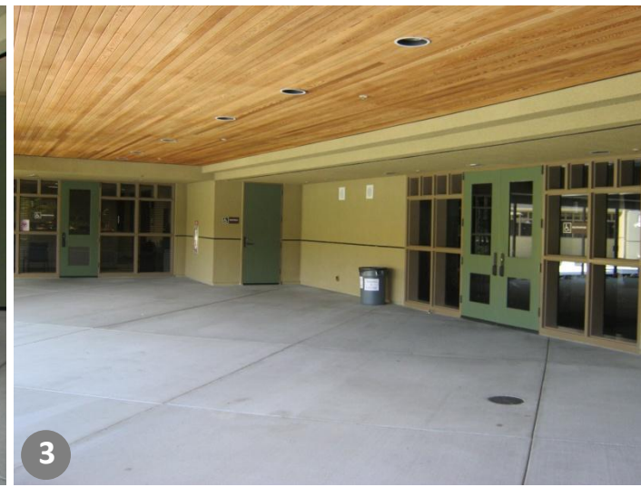
3 Main entrance and adjacent MPR entrance