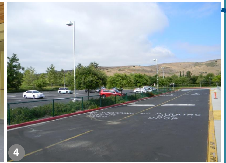
4 Parking and drop-off