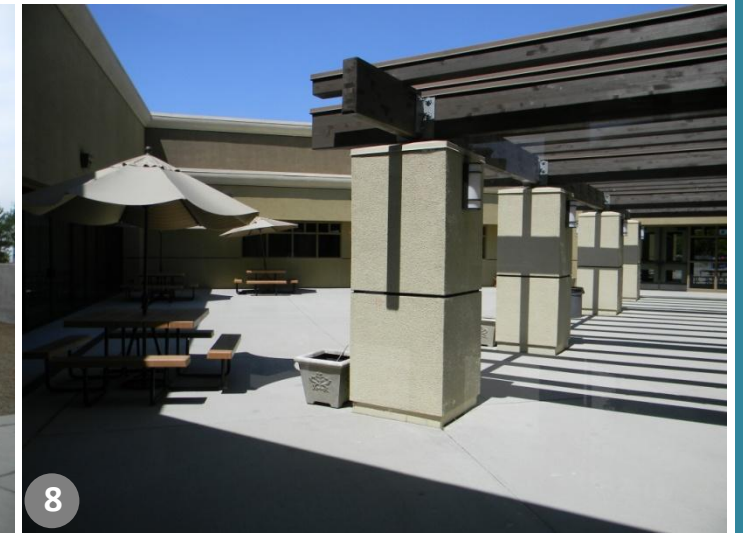
8 Central courtyard near MPR