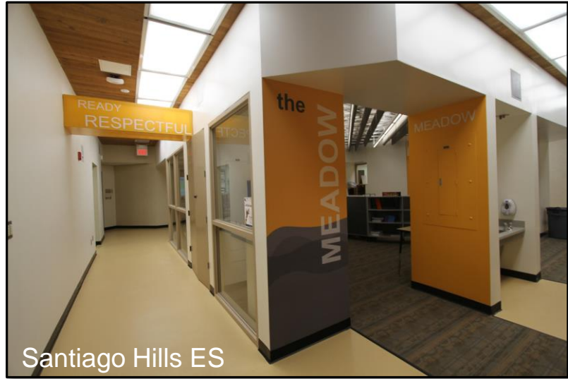
Santiago Hills ES