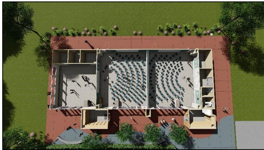
Brywood ES: Classroom Building Rendering (Plan)