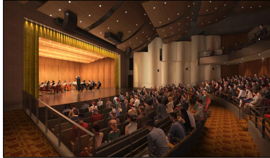
Woodbridge HS: New Theater Rendering (Interior)