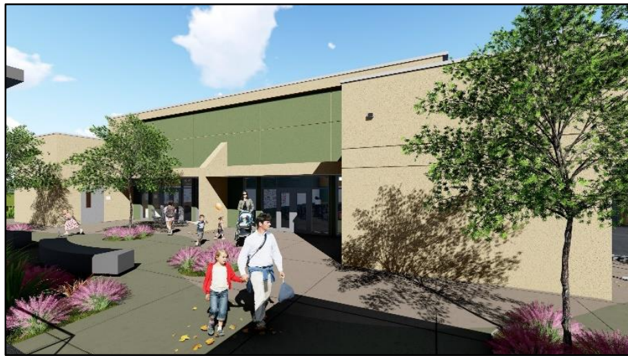
Meadow Park ES: Classroom Building Rendering (Exterior)