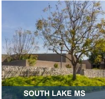
SOUTH LAKE MS