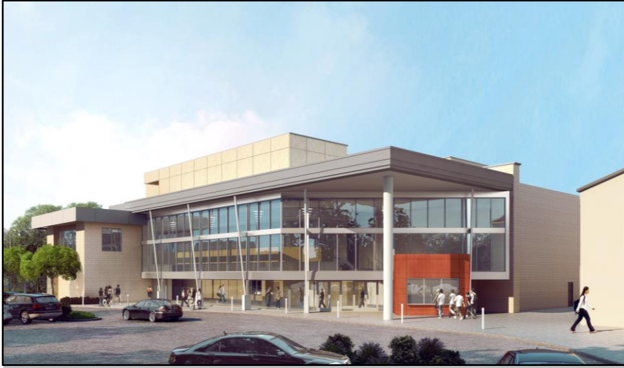
Woodbridge HS: New Theater Rendering (Exterior)