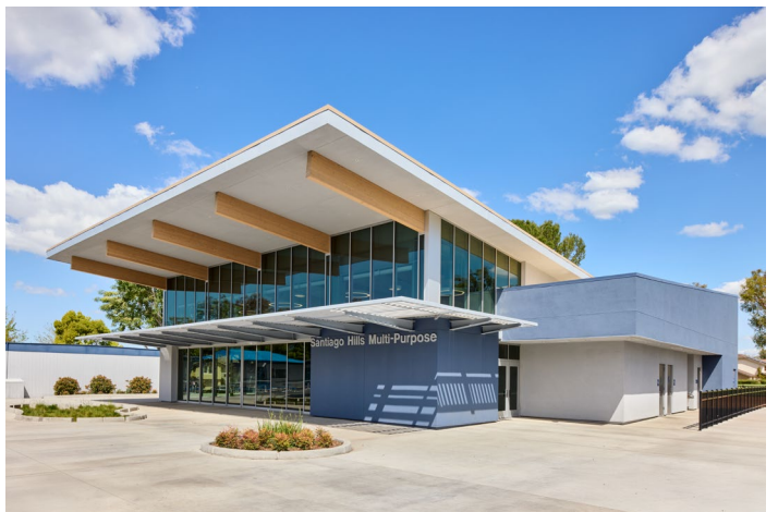
Santiago Hills ES: New Multipurpose Building