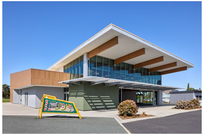
Greentree ES: New Multipurpose Building