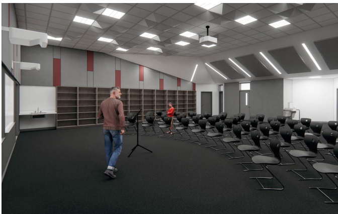
Sierra Vista MS: New Music Classroom