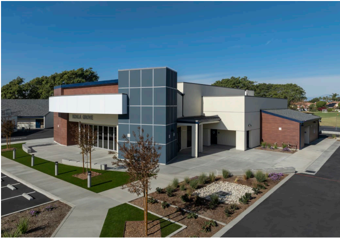
Culverdale ES: New Multipurpose Building