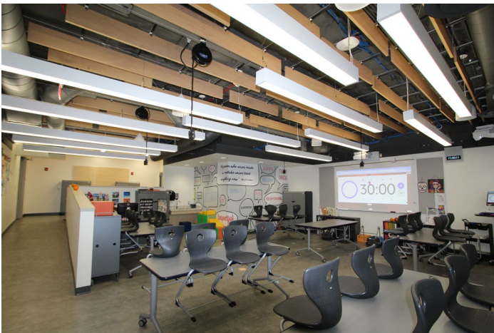
Santiago Hills ES: Interior Improvements