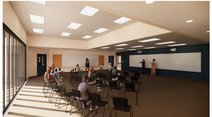
Lakeside MS: New Music Classroom