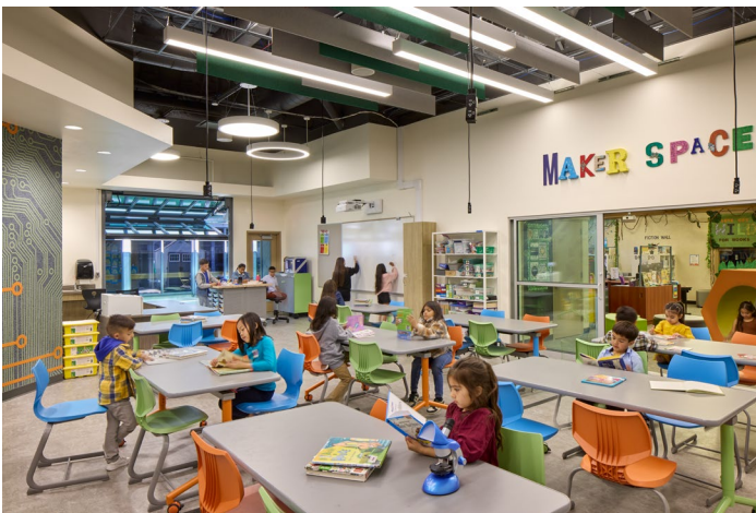
Greentree ES: Interior Improvements