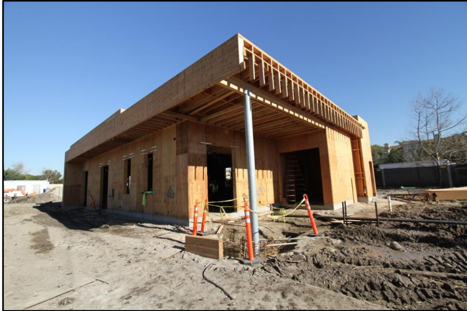
Exterior of Science and Fitness Building