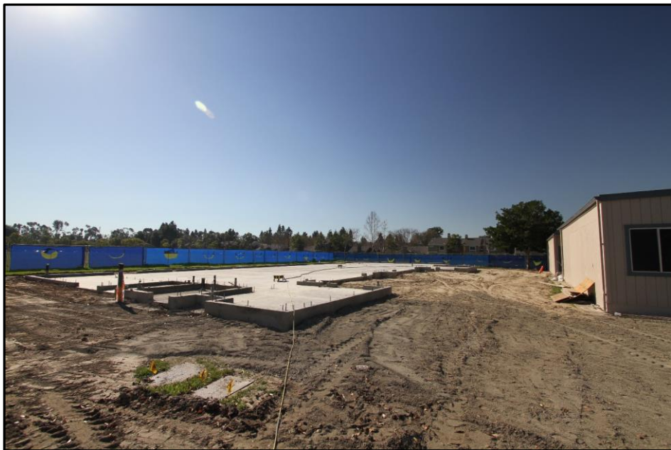
Meadow Park ES