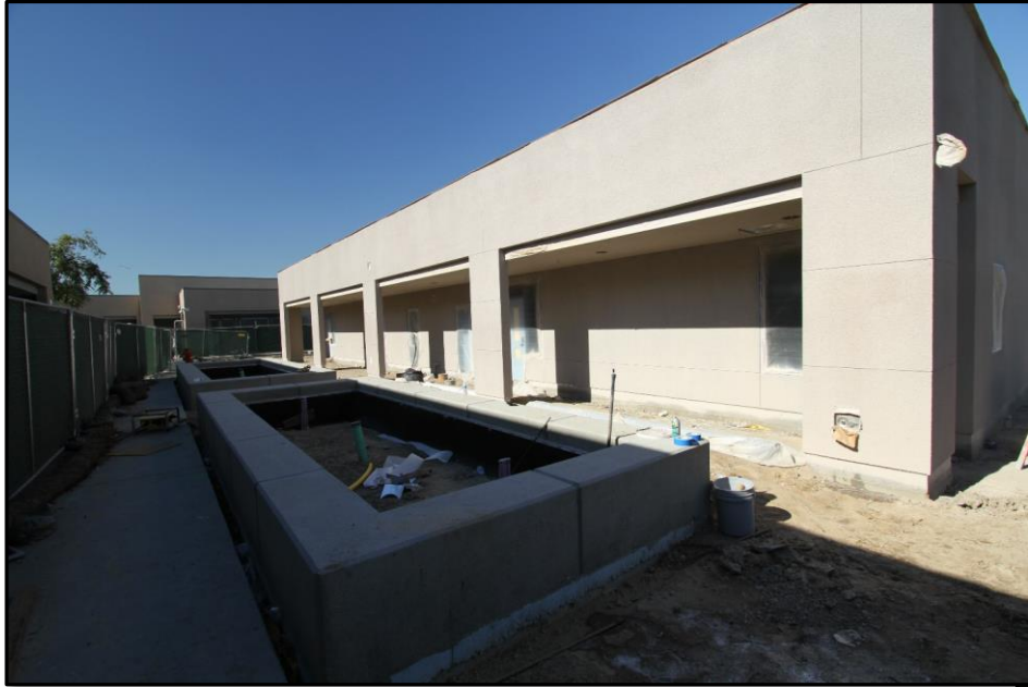
Exterior of classroom building