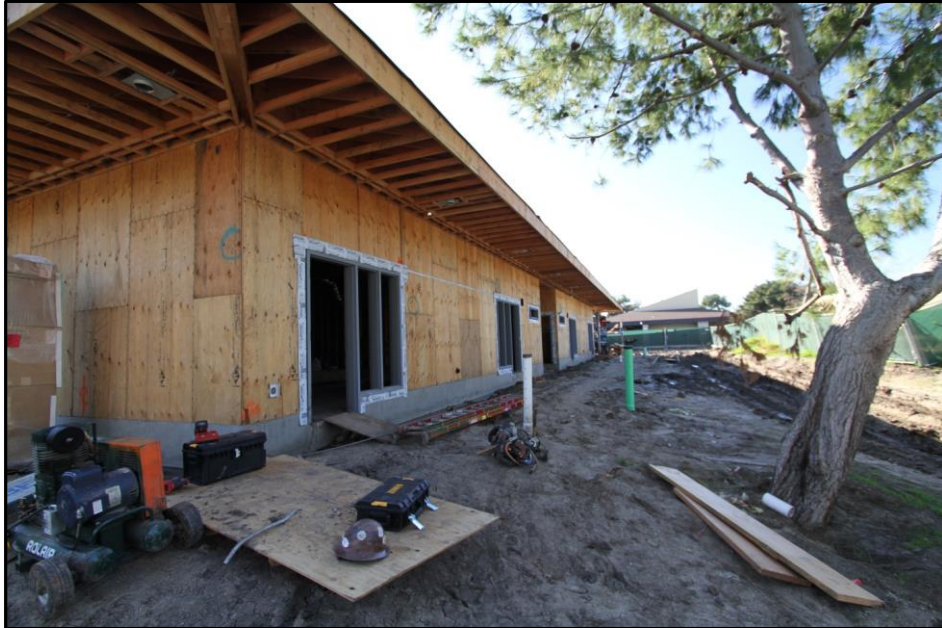
Exterior of classroom building