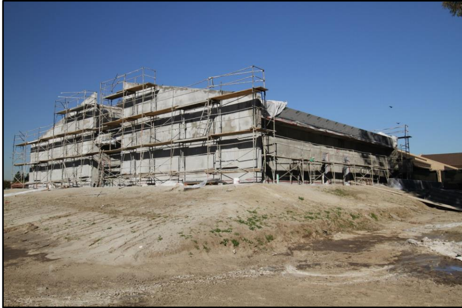
Exterior of classroom building