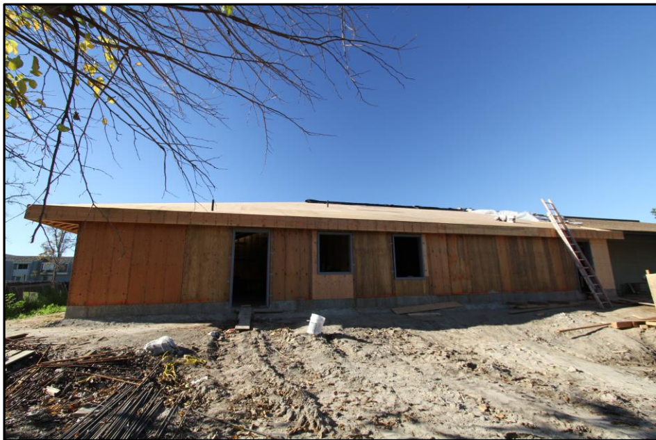
Exterior of expansion