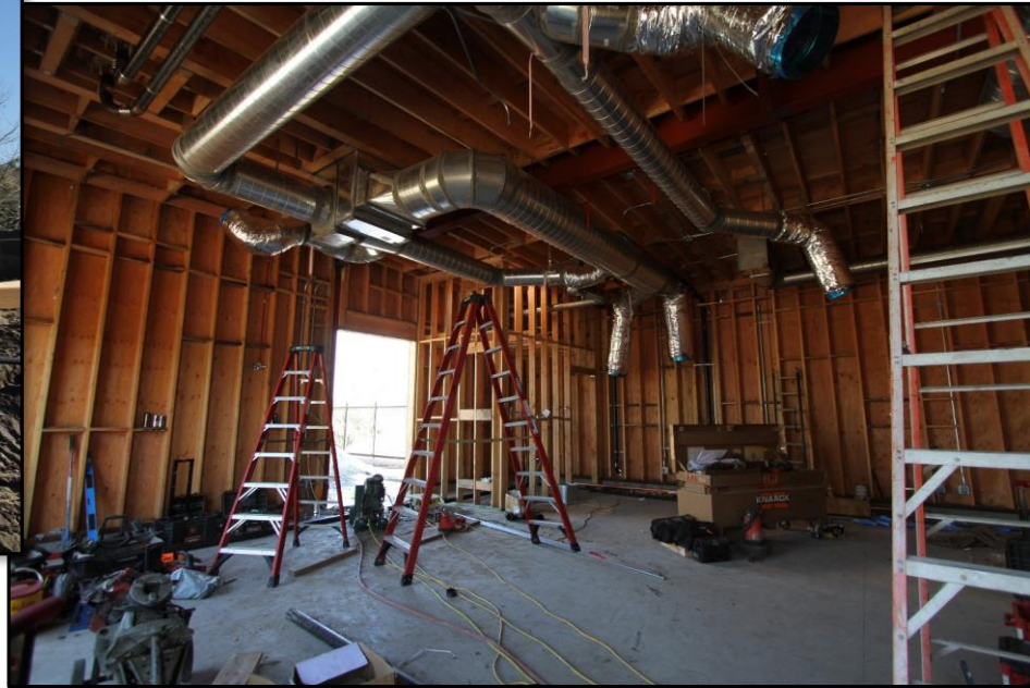
Interior of Science and Fitness Building