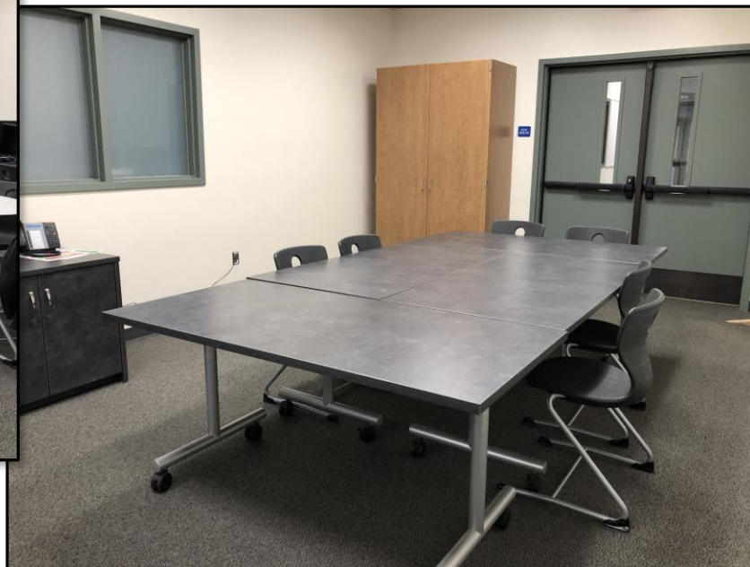
Pull-out / Conference Room