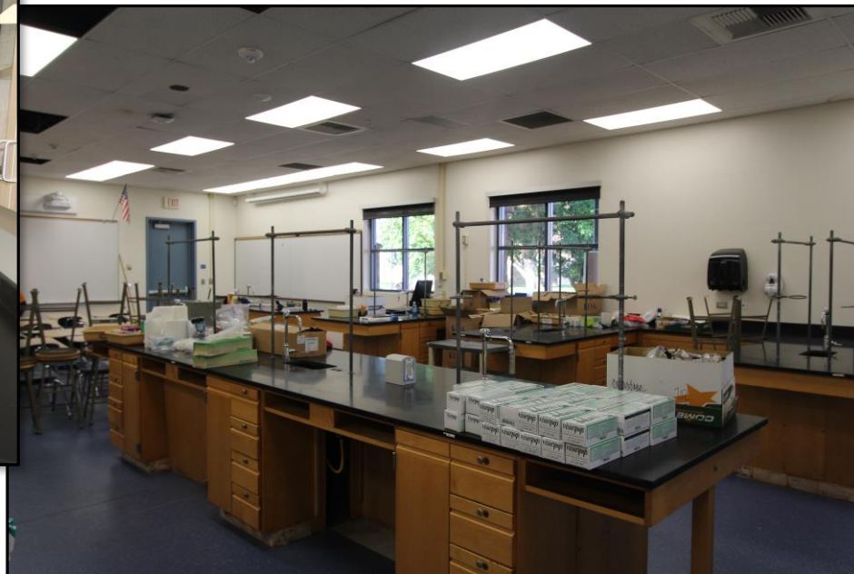
Upgrades to Science Classrooms