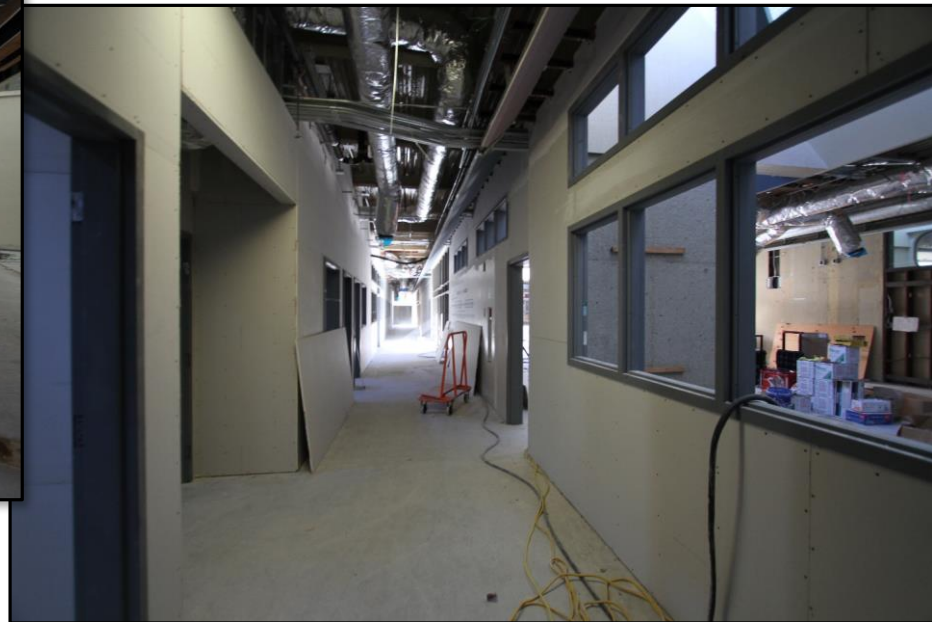
Hallway adjacent to Administration Offices