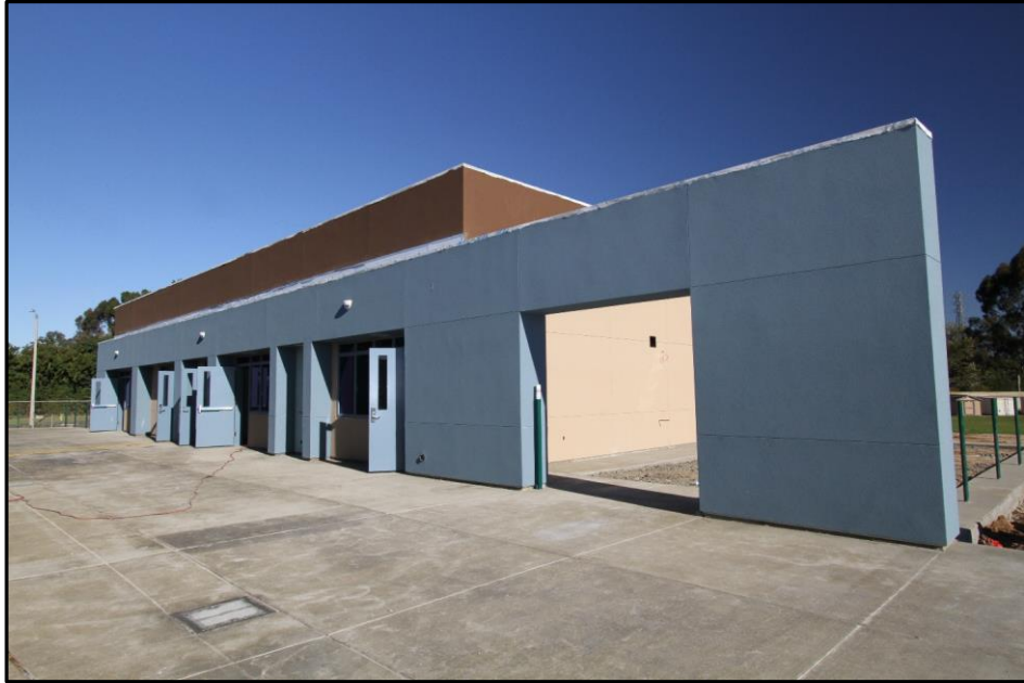
Exterior of classroom building