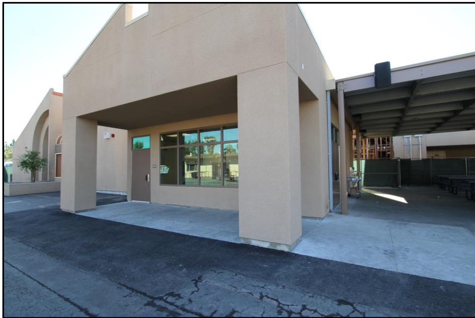
New Food Services